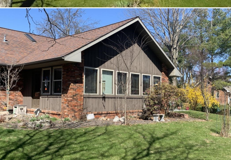
ADDRESS: 13 Ruth Circle, Monroe City, MO 63456