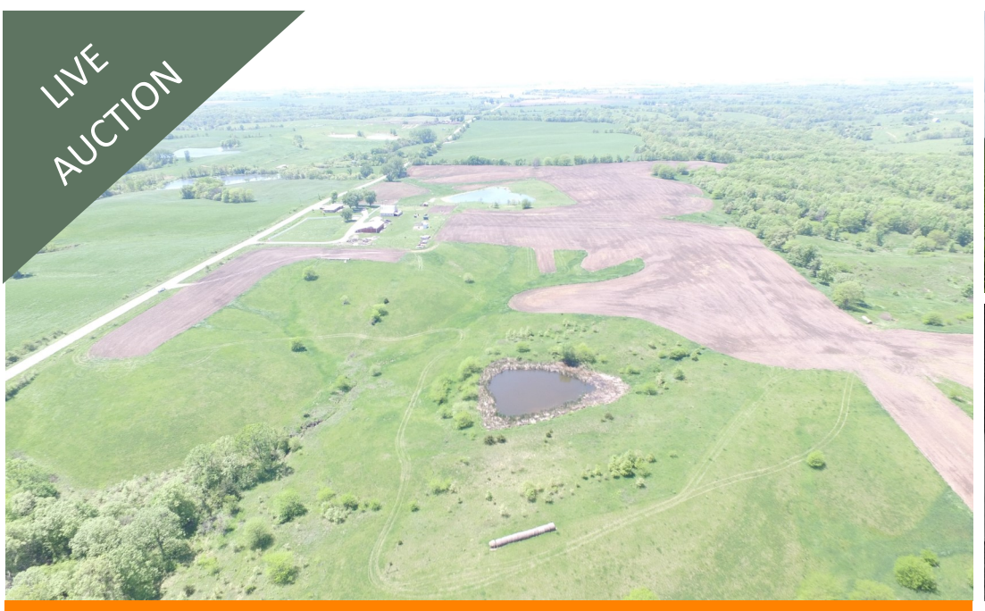
AUCTION DATE: September 6, 2017 @ 10AM HELD AT: Cincinnati Community Center, 102 Depot Lane, Cincinnati, IA 52549

Trophy Properties and Auction • 855.573.5263 • www.Trophypa.com